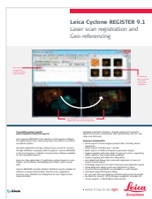
Leica Cyclone REGISTER